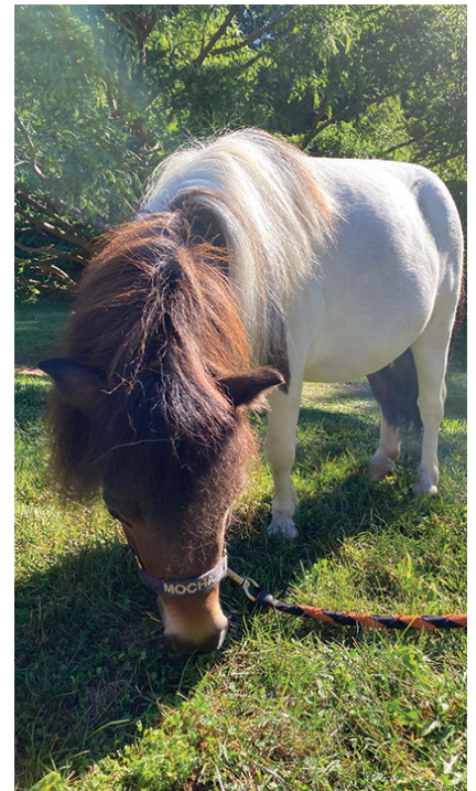
Mocha the Miniature Horse will be galloping back to the Festival!