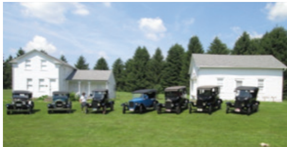
The Model T Club will be part of the 2021 Harvest Festival!