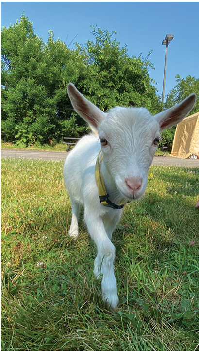
Buttercup the Goat will be available to groom and pet!

www.stowhistory.org email shsfestival@gmail.com