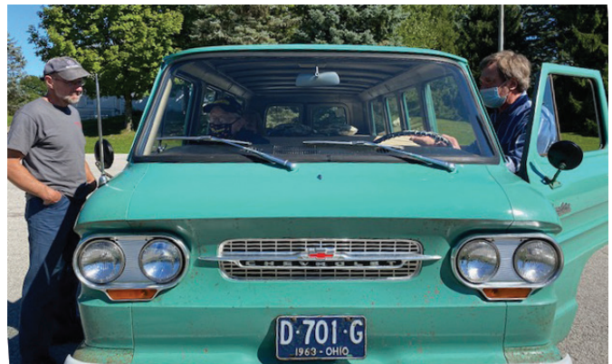
Corvair Club is coming back to the Harvest Festival!