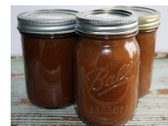
Apple Butter $5.25