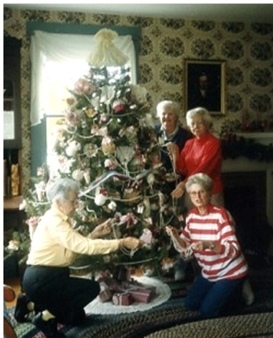
Stow Historical Society members decorating the Christmas Tree at Heritage House Museum circa 1970's.

Our friends at Hower House, in partnership with The University of Akron School of Music, are presenting their second annual concert series. The next concert, Graduate String Quartet Concert, will be December 9th at 7:00 p.m. Contact Hower House Museum (330-927-6909) or howerhouse@uakron.edu to reserve your spot. Visit www.howerhouse.org for updated information.