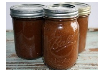
Apple Butter $5.25